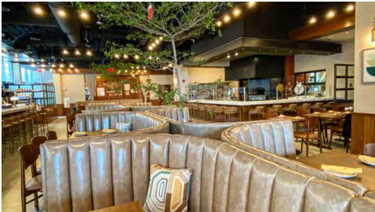
Serafina in the Seaport.

The second Serefina location is slated to open this month.